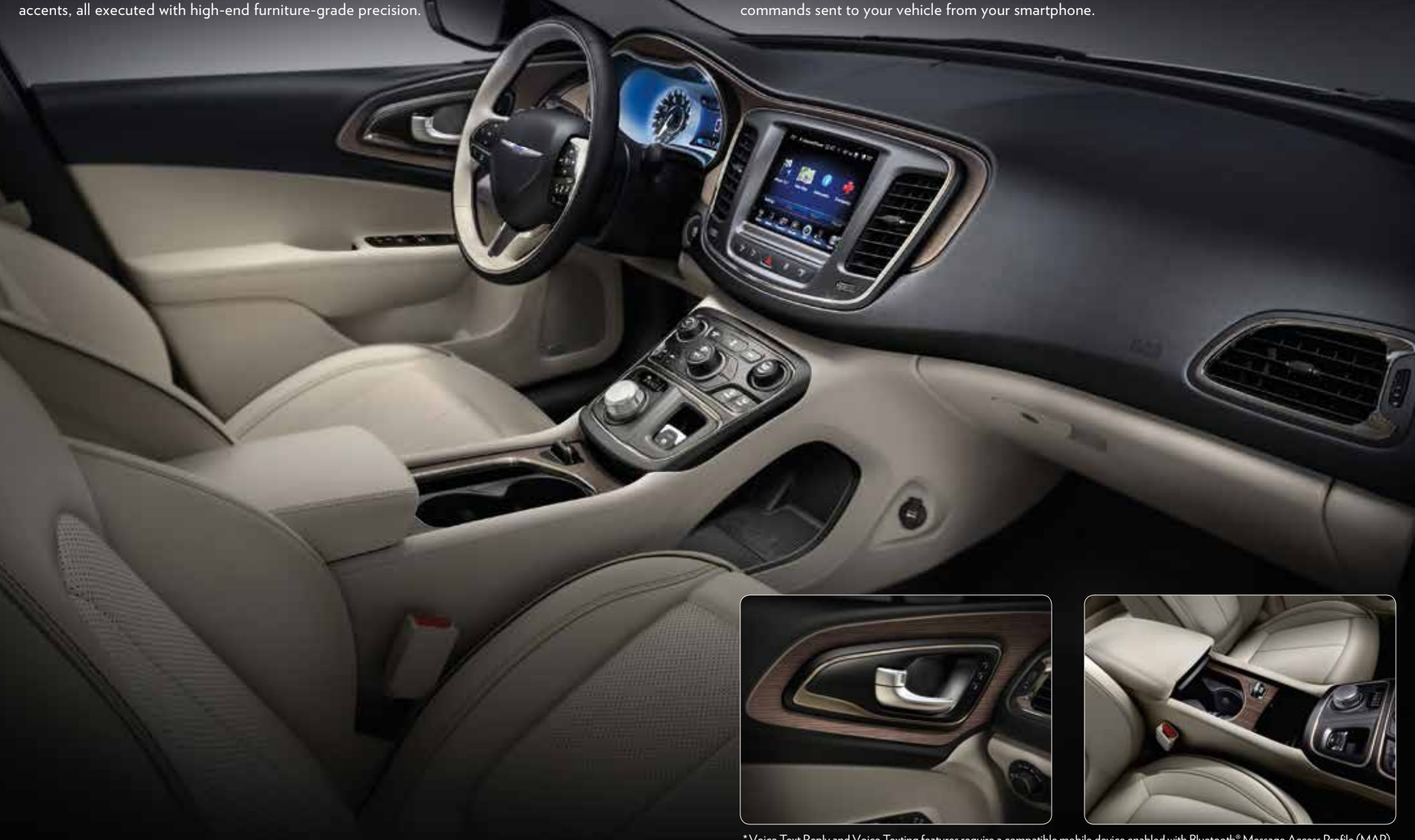
*Voice Text Reply and Voice Texting features require a compatible mobile device enabled with Bluetooth® Message Access Profile (MAP). iPhone® and some other smartphones do not currently support Bluetooth MAP. Visit UconnectPhone.com for system and device compatibility.

Imagine a built-in tablet that navigates your route, plays your favorite songs, activates your available heated seats and steering wheel, gives you weather and traffic reports and calls and texts your contacts* for you. This technology and much more is available to you without ever taking your eyes off the road with the available advanced 8.4-inch Uconnect® system, which includes SiriusXM® Radio² and standard voice command capability. The available Uconnect Access includes a 3G Network connection with built-in data, on-demand WiFi hotspot and apps, including Theft Alarm Notification and Stolen Vehicle Assistance. Gain access to all of this and more along with the ultra-convenience of remote commands sent to your vehicle from your smartphone.